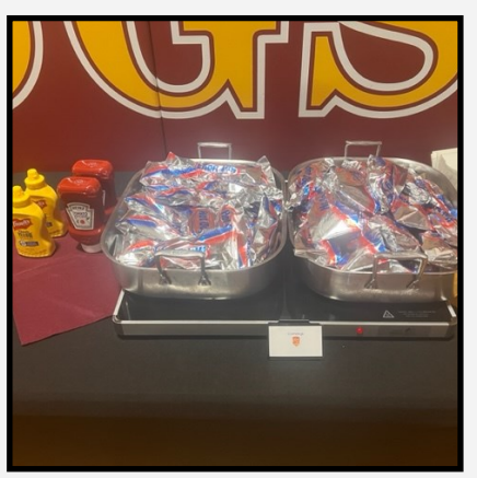
HOCO Dance Corndogs