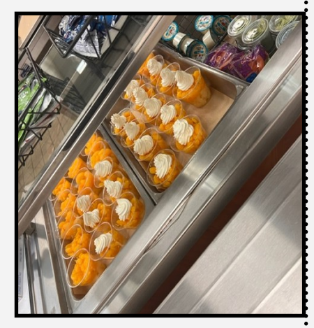
Halloween Fruit cups