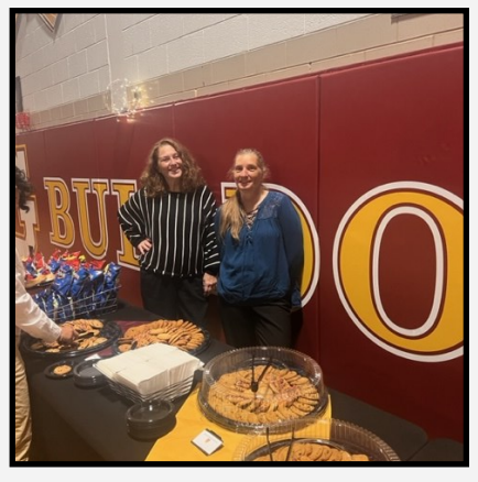
HS Staff @ HOCO Dance

The staff at the High School were busy this month. We added new menu items to include Stromboli & Buffalo Chicken Quesadillas. They worked hard to put out great food for the committee & board meetings and did a fantastic job with the spread for HOCO Dance. We cheered on the Phillies for Red October and celebrated Halloween with students & staff with a special Halloween treat.