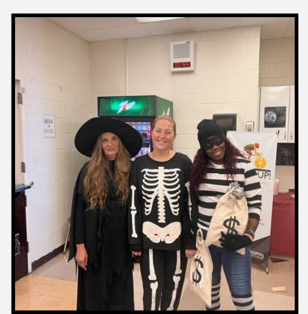
Halloween @ HS