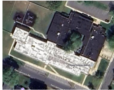
Rodgers Elementary School