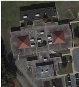
Bowe Middle School