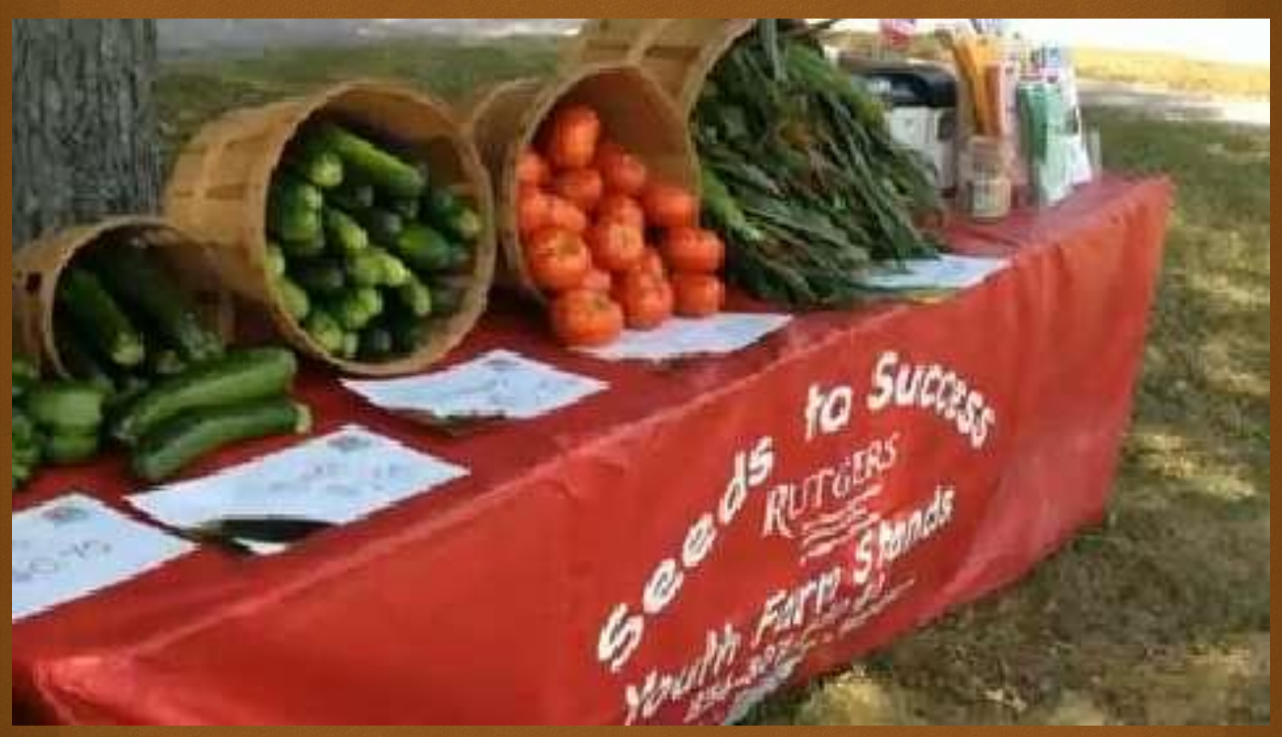
Phil Dunn, Courier-Post 9:40 p.m. EDT July 8, 2014 http://www.courierpostonline.com/story/news/local/south-jersey/2014/07/08/glassboro-school-uses-farm-...